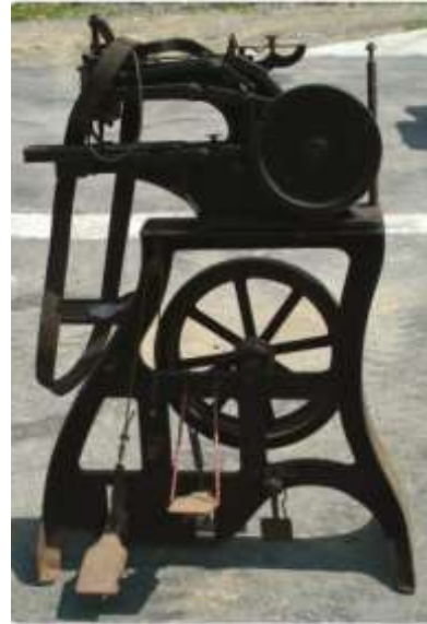
Landis Lock Stitch Heavy Harness Machine