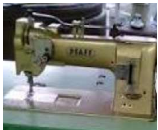
PFAFF industrial electric sewing machine 145 GB H3SN