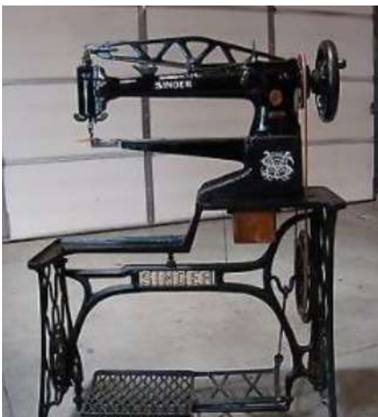
Singer 29K62 long arm Patcher sewing machine